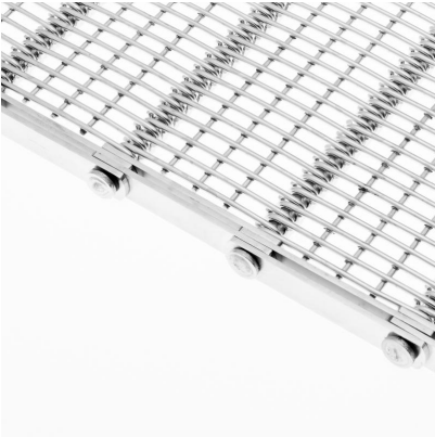
EYE LINK WITH ELECTRO WELDED ROD CONVEYOR BELT (CMG-VE)