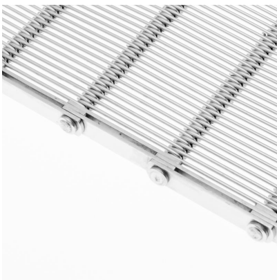
EYE LINK CONVEYOR BELT (CMG)